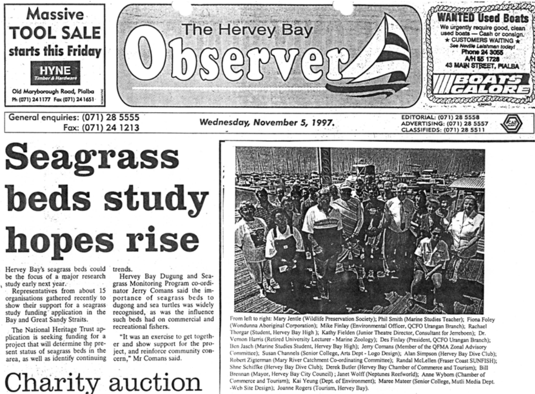
Figure 3. Article from Hervey Bay Observer stating that SGW's seek for funding.

committee gathered all their supporting organizations and applied to the Natural Heritage Trust Foundation for funding. After many struggles, funding finally came through and is currently being used until it runs out in November 2001 (Comans, 2000; Comans, Pers. Comm. 2000).