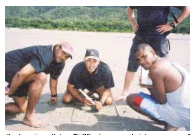
Students from Cairns TAFE take canopy height measures of seagrass in the northern Yule Point site.

The two sites at Yule Point were again monitored by students from Cairns TAFE with their lecturers Chris Wegger and Tom Collis as part of the "caring for country" program. The germination of Halodule uninervis seeds which occurred in May, has culminated in an increase in seagrass cover in August this year.