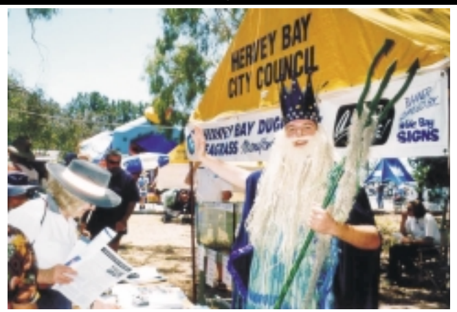
Seagrass-Watch gets a helping hand from the great man himself "King Neptune" who pronounced the program " a great winner for all sea-life concerned".