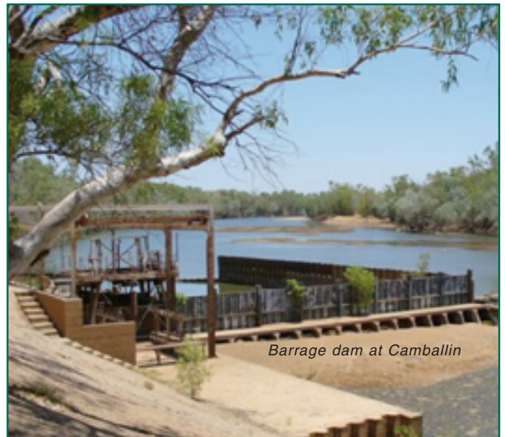
Barrage dam at Camballin

The research has found a noticeable difference in fish species composition above and below the barrage at Camballin. This piece of infrastructure, the only major artificial barrier on the Fitzroy River, was constructed fifty years ago for what turned out to be a failed irrigation project. The barrage effectively blocks the upstream migration path of fish for large parts of the year. As a consequence, Freshwater Sawfish — listed as a threatened species under Commonwealth legislation — are getting trapped below the barrage and so