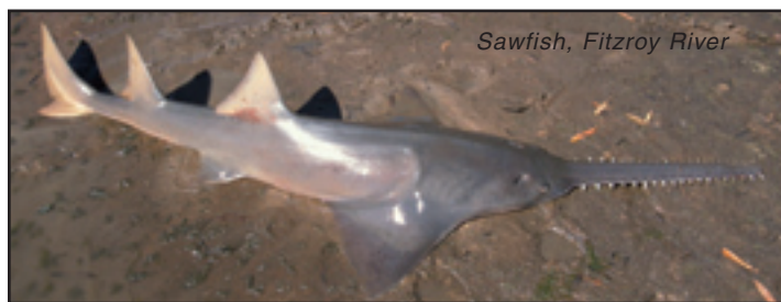
Sawfish, Fitzroy River

being exposed to greater fishing and predation pressure. The Murdoch University scientists have been calling for a fishway to be constructed at the barrage for a number of years now.