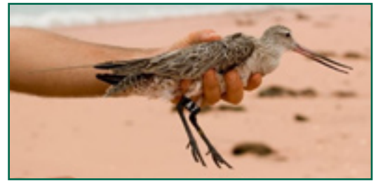
This bird, a female with an implanted transmitter, is marked 'A7'. Note the antenna that is faintly visible along her tail.