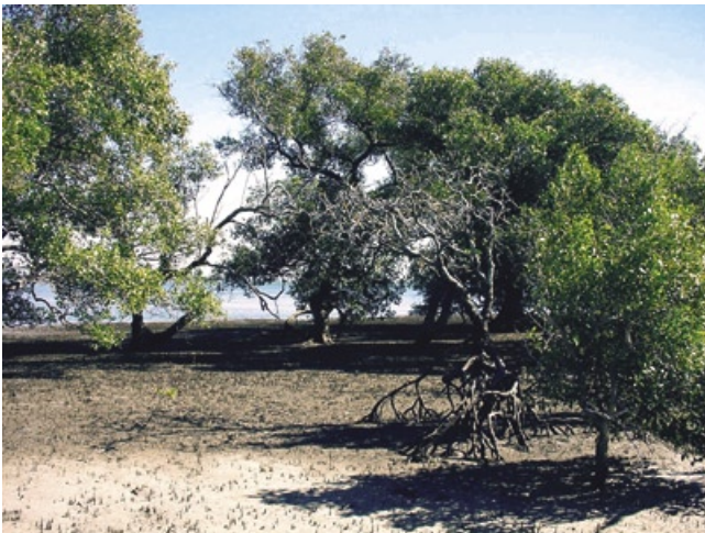
Mangroves at low tide

Knowledge of Queensland's habitats and biodiversity continues to grow, although gaps remain, particularly in knowledge of the coastal zone of Cape York and the Gulf of Carpentaria. There is increased knowledge of the extent of seagrasses, mangroves and saltmarsh in Queensland, more detailed mapping of the biodiversity of the Great Barrier Reef, along with monitoring of coral cover, and growing knowledge of the species diversity of the marine environment. However, trends in habitat and biodiversity are often difficult to establish, because either only baseline studies have been conducted or the design of studies has made comparisons difficult.