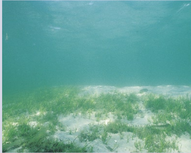
Dugongs and the green turtle feed on seagrass meadows.

Volunteers have been trained in scientific protocols to assess the health of seagrass meadows. All data collected are entered into a database and results are presented in newsletters and reports. Seagrass Watch has assisted with assessment of dredging activities, coastal developments, sewage outfalls, boating damage and algal blooms. Information collected contributes directly to marine park planning and provides information for assessing management actions and catchment practices.