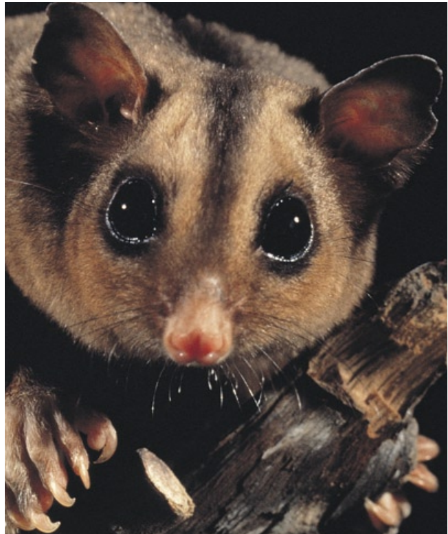
Pressures on the coastal zone can disturb the habitats of threatened and vulnerable species, including the mahogany glider.

In key areas of the state, coastal strip development is placing increasing pressure on specific coastal habitats (figure 6.6). Protected areas in the coastal zone are notably small and fragmented lands. Clearing for urban development is discussed in 'Coastal resource use and development'.