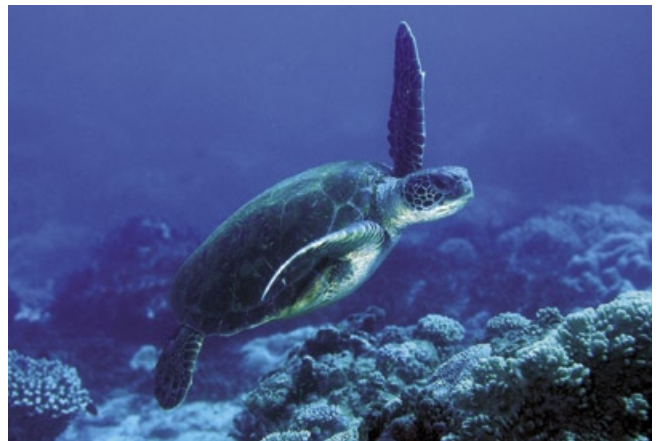
Queensland's coastal zone supports six of the world's seven species of marine turtles.

Queensland's coastal zone supports an enormous range of life of world significance. It is a series of highly intricate ecosystems noted for their rich species diversity, particularly within the two World Heritage Areas, the Wet Tropics and the Great Barrier Reef. The coastal zone supports a number of iconic species, including six of the world's seven species of marine turtles, the humpback whale, dolphins and dugongs, while habitat adjoining the coast supports a number of other vulnerable and endangered species, including the mahogany glider and the southern cassowary. The coastal zone also contains the bulk of Queensland's population, which places significant pressure on coastal habitats. Growing pressures on the environment present challenges that will require innovation to adequately protect Queensland's marine and coastal biodiversity.