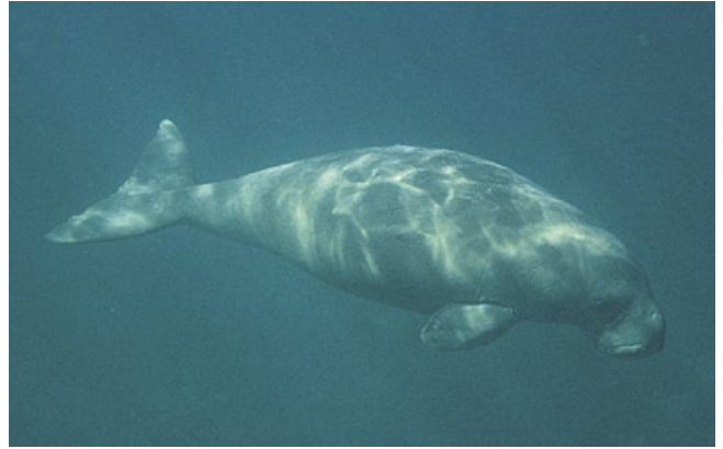
New evidence suggests that the dugong population has stabilised.

Coordination of the development of protection measures by various agencies also requires consideration, as a range of departments and agencies across different levels of government take a role in environmental management. State-Commonwealth cooperation in dealing with water quality issues on the Great Barrier Reef is a welcome development.