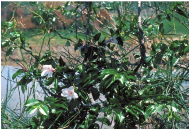
Coastal ecosystems are altered through the impacts of exotic and displaced species such as rubber vine ( Cryptostegia grandiflora ).

Coastal habitat and biodiversity are subject to pressures arising from direct human activity, such as plant disturbance and removal associated with building and engineering works, and the accidental or deliberate killing of species, resulting from actions such as the release of toxic materials, fishing, roadkill, hunting and collecting. Maritime transport also has impacts on coastal ecology through pollution incidents, poor mooring practices, and the release of contaminants and marine pests. In addition, coastal ecosystems continue to be altered as a result of the impacts of exotic and displaced species such as lantana, rubber vine and feral pigs.